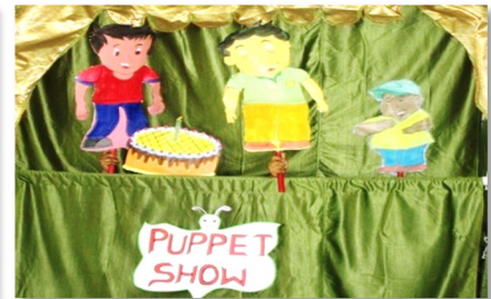
Teaching through Puppets