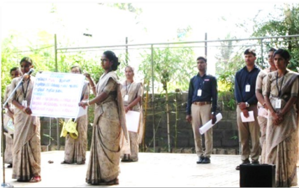
Theme based Assembly