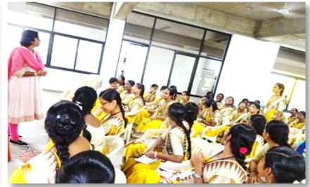
Workshops by Eminent Resource Persons