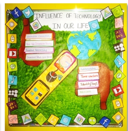
Creative Notice Boards