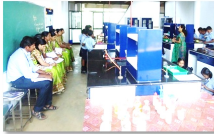
Innovative School Visits