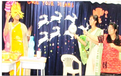
Teaching through Roleplay